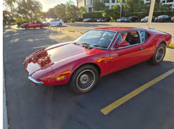
Louie Villa - Ready to Run the Canyons!